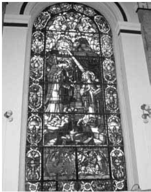
Real Stained Glass Windows