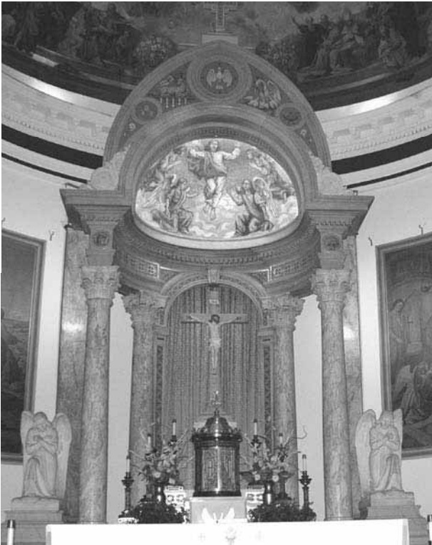
Marble Baldachino (canopy over Tabernacle)