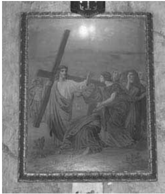
Oil Painted Stations of the Cross