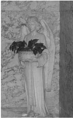
Holy Water Fonts