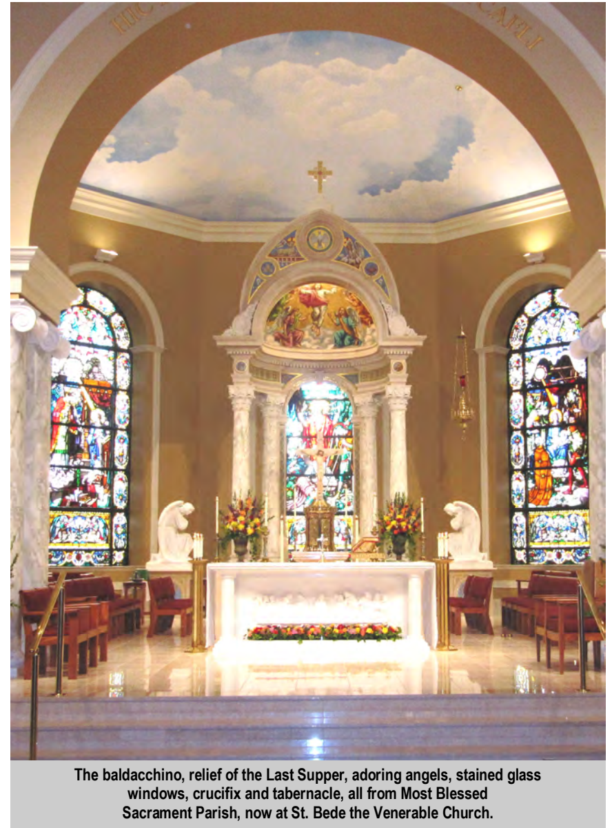
The baldacchino, relief of the Last Supper, adoring angels, stained glass windows, crucifix and tabernacle, all from Most Blessed Sacrament Parish, now at St. Bede the Venerable Church.