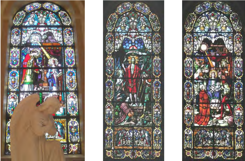
Three large stained glass windows from MBS now surround the sanctuary at St. Bede Church - (from left) The Annunciation, The Resurrection and the Nativity.