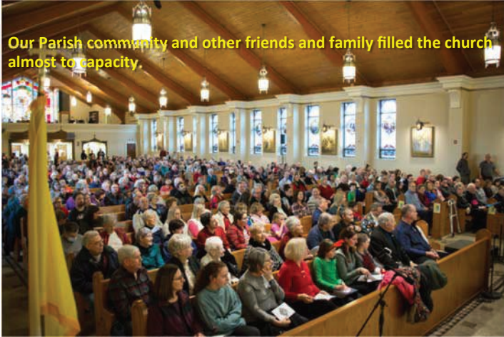
Our Parish community and other friends and family filled the church almost to capacity.