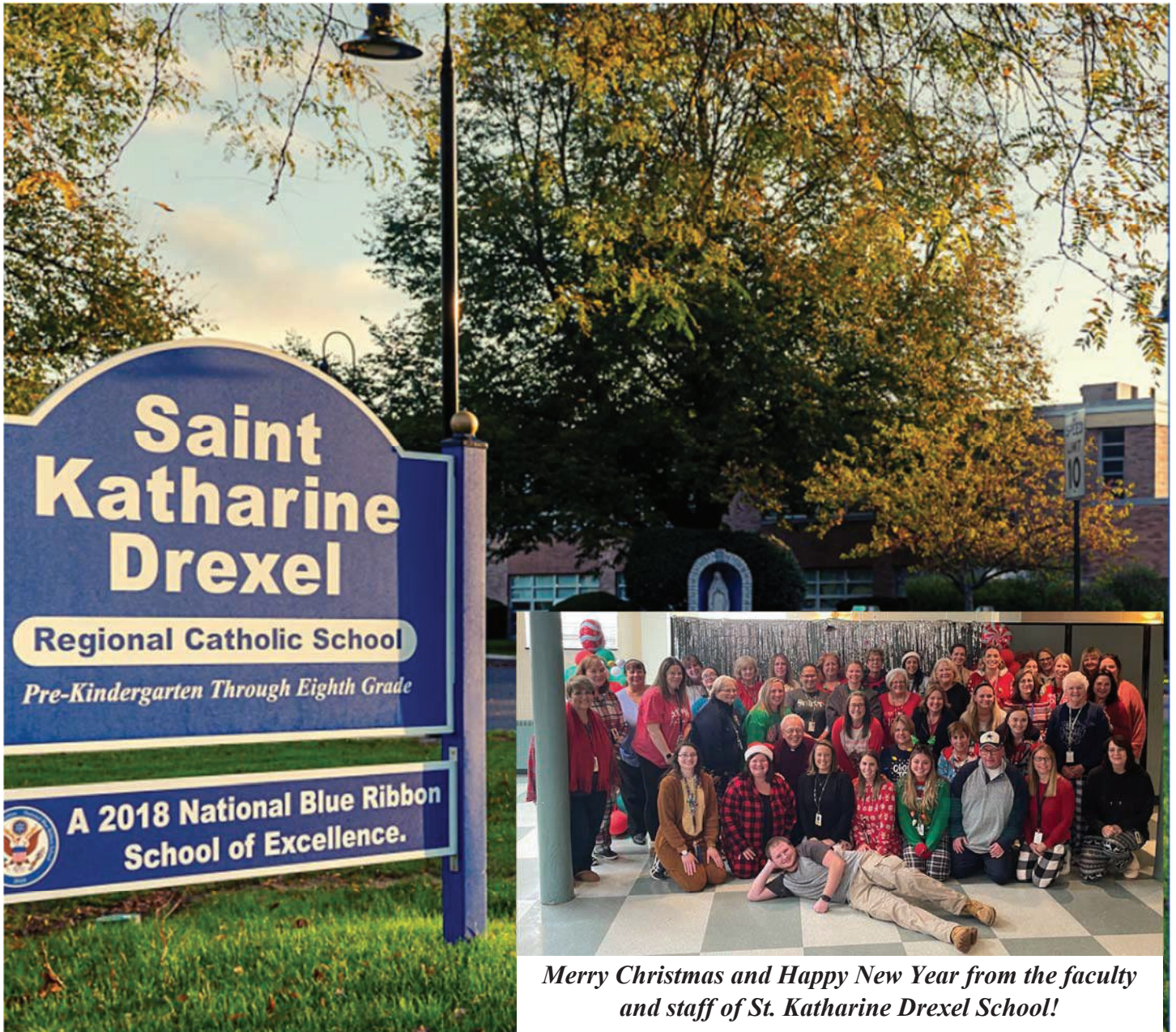
Merry Christmas and Happy New Year from the faculty and staff of St. Katharine Drexel School!