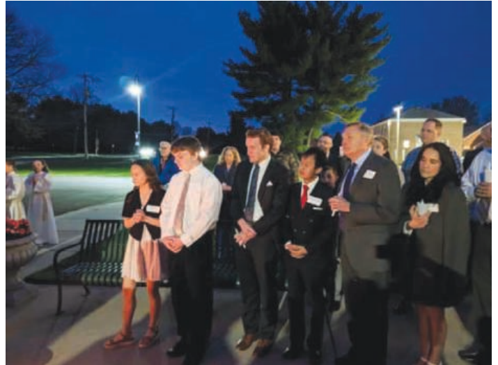
The procession and lighting of the fire, which is symbolic of the undimmed light of Christ, was a very moving part of the Easter Vigil. This reminds Christians that Jesus is the Light in the darkness; and how by their baptism they are to carry His light to a darkened world.