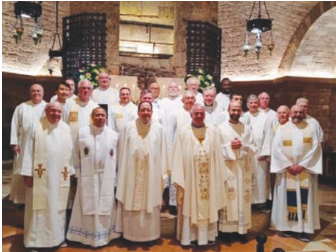
The group celebrated Mass at the tomb of St. Francis of Assisi.