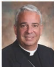
Archbishop Nelson J. Pérez Archbishop of Philadelphia