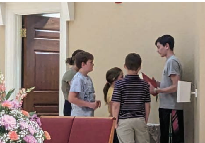
June 25, 2023