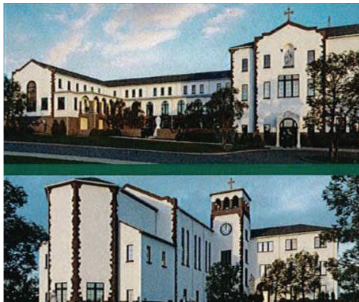
An artist’s rendition of the future St. Charles Seminary.

The most important thing is that the quality of the theological, scriptural, spiritual, and human formation that has been the hallmark of St. Charles Seminary priests will continue, no matter where the location. Now it will happen in a fresh new facility that will be state-of-the-art for our time.