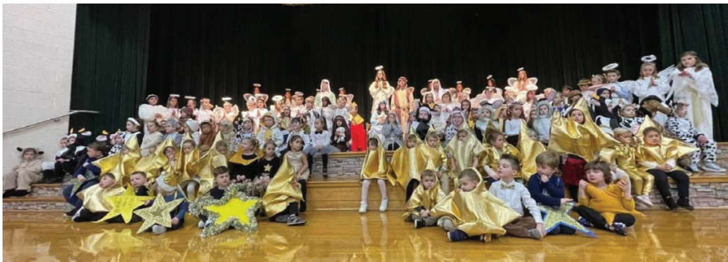
Saint Katharine Drexel School celebrated the coming of Christmas with an enactment of the Birth of Jesus. The cast and choir included several students from pre-k through 8th grade. The gym was filled to capacity with parents and grandparents.