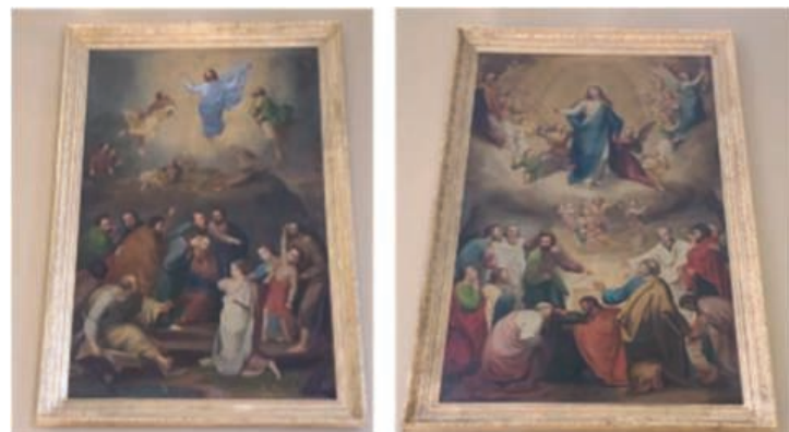
Newly refurbished paintings of the Transfiguration of Our Lord and the Assumption of the Blessed Mother, now installed in our church sanctuary.

The Psalm refrain expresses the essence of the celebration: "Lord, every nation on earth will adore you." From Isaiah's vision of a world beating a path to God's door, to Saint Paul's inclusion of Gentiles as copartners in the promise of Christ Jesus, to the appearance of magi from the East, we celebrate God's salvation for all people. As we listen to these readings, let us be mindful of the places in the world that desperately need to hear God's saving message.