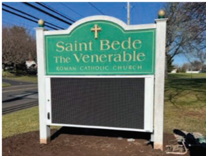
Our newly installed, state-of-the-art digital electronic lawn sign.

Now, like so many campuses throughout our community, we will be able to share the Good News of what is happening here at St. Bede. If anyone is interested in donating towards the cost of these two "gifts", and perhaps memorializing a loved one, please contact me in the Rectory Office (215-357-5720).