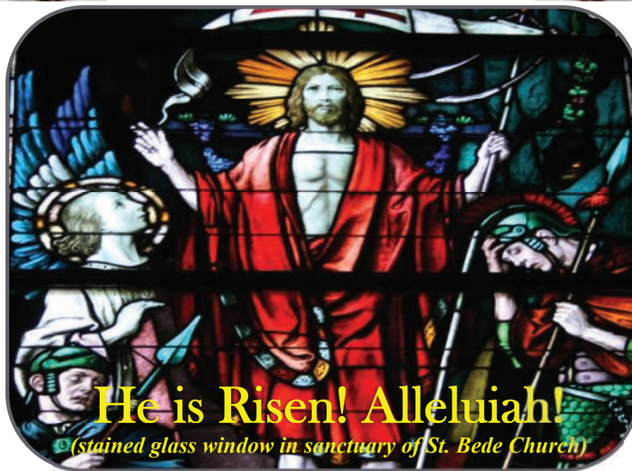
(stained glass window in sanctuary of St. Bede Church)